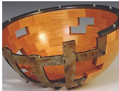
Segmented bowl construction by Curt Theobald

Demonstrators seen at the recent Louisville, KY AAW National Symposium June 1-4, 2023