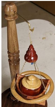
Figure 1 Andy Brundage-3 corner turning- Tulipwood, Red heart, Yellow heart

An interesting mix of Christmas Tree Ornaments came to the meeting this year. Spindle turnings or modifications were not the only designs present, although those showed some real turning ability with woods that might be tough to turn and not have to make multiple tries to complete the item.