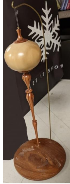
Figure 5 -Kent Townsend-- Maple Globe, Mesquite base