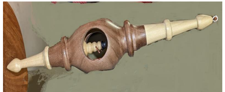
Figure 2 -Tony Mansheim Reverse Turn w/Snowman- Walnut, Poplar