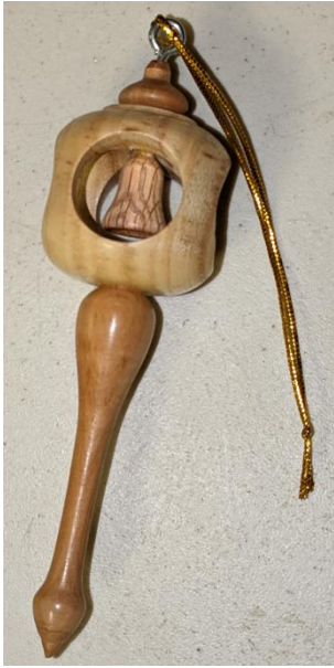
Figure 3 James Carrier-Reverse turn -- Ash, Oak, Maple

Pictures don't do justice to the intricate designs, colors and unique shapes incorporated into these ornaments.