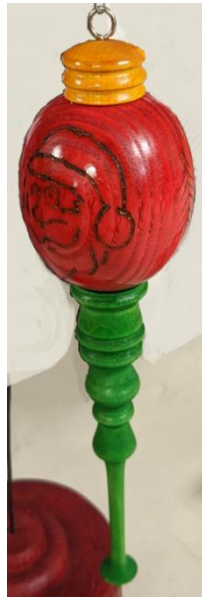
Figure 4 --Mikeal Jones-- Sycamore and Hard maple