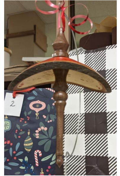
Figure 6 -Steve Dougherty--Hickory Bowl, Walnut finials