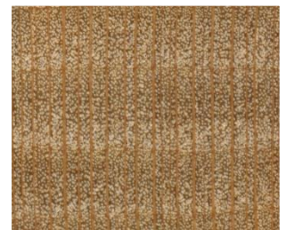
Sycamore end grain view