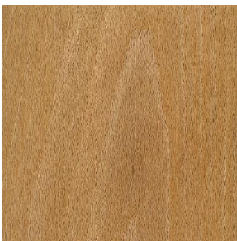
Sycamore Flat sawn