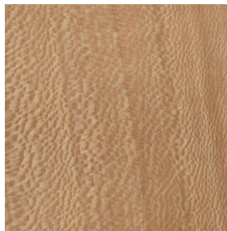
Sycamore Quarter sawn