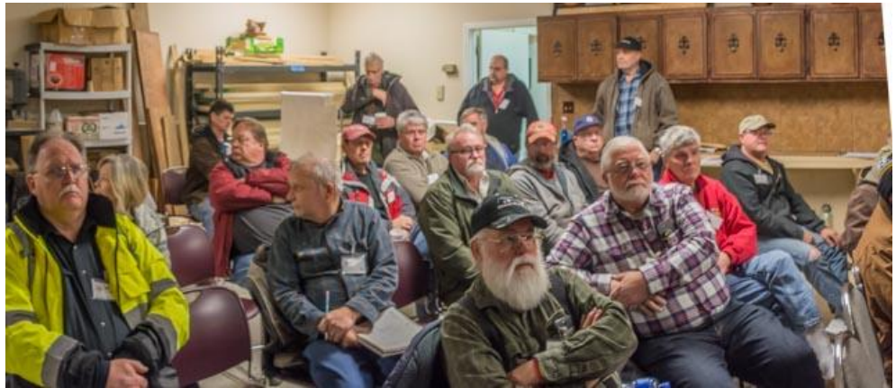
January Meeting Attendance