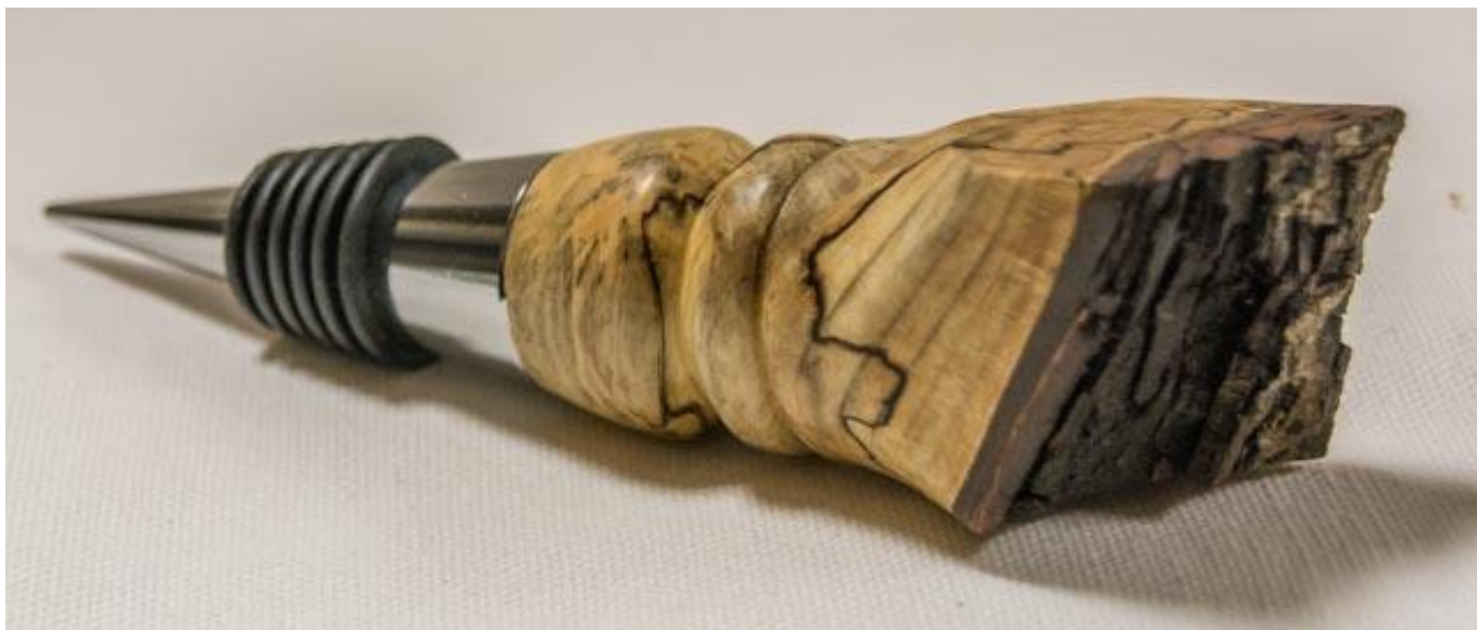
Wine Cork from natural spalted wood