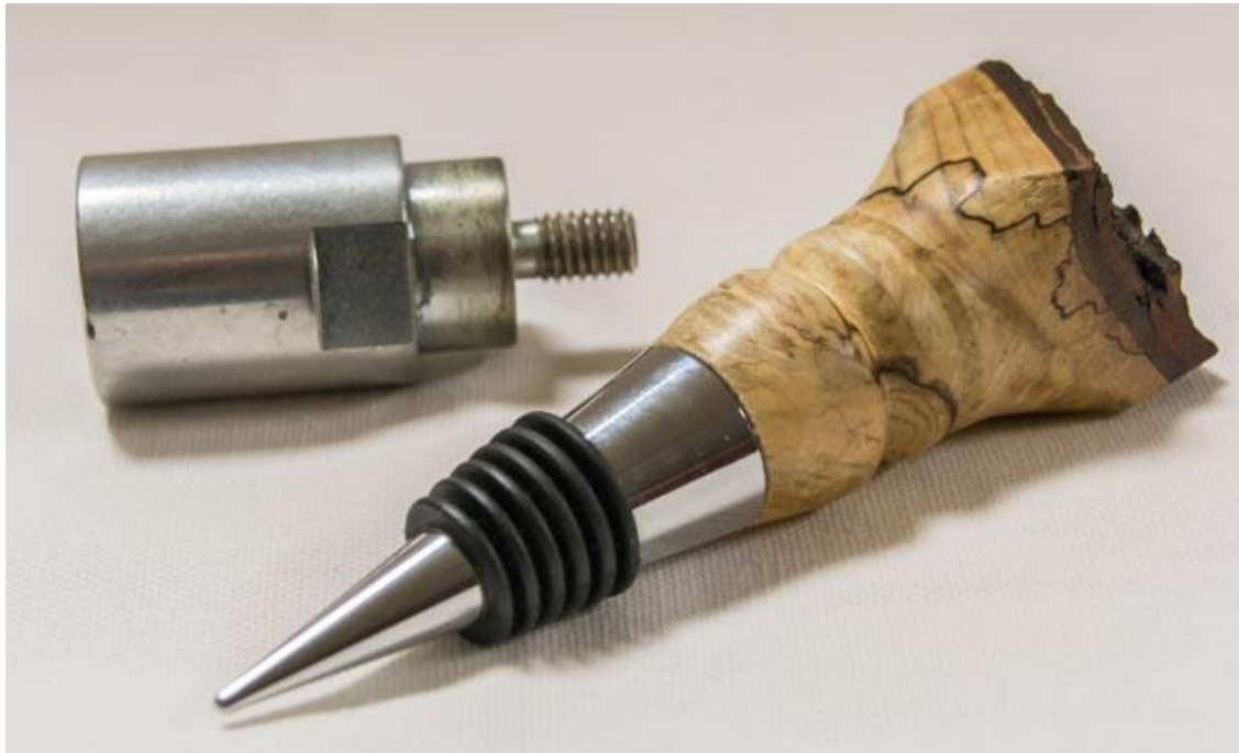
Another view of the Wine Cork showing how the turning jig attaches to the wood for turning.