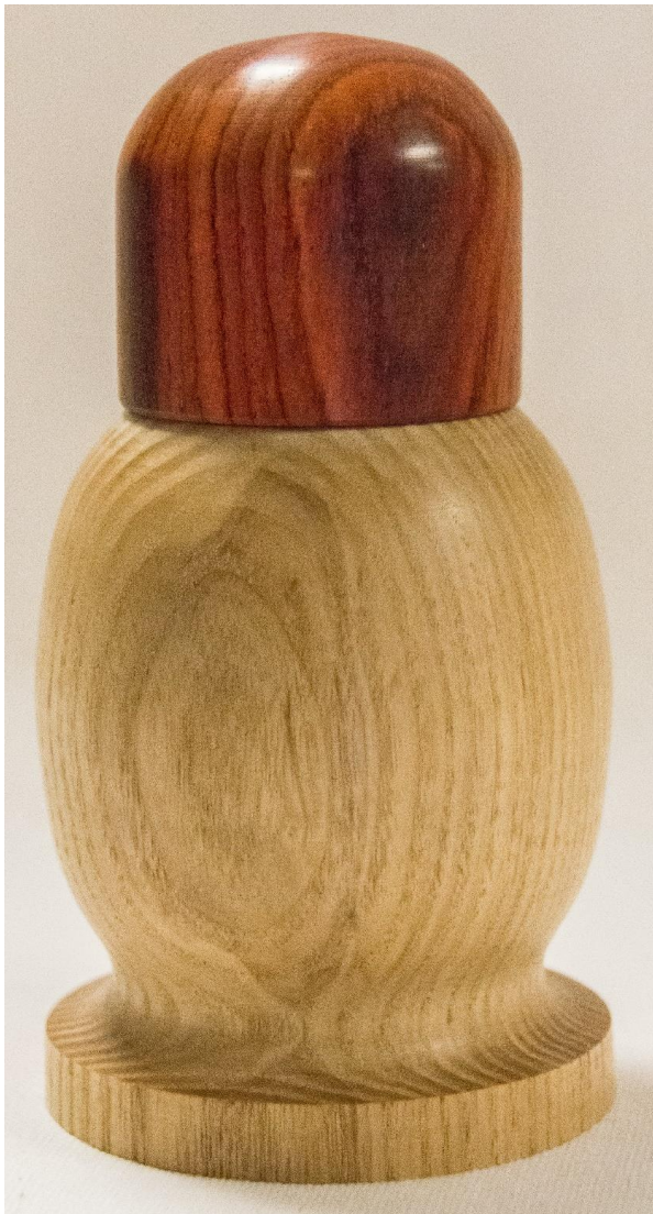
Untitled object with threaded cap by Vaughn Bradley