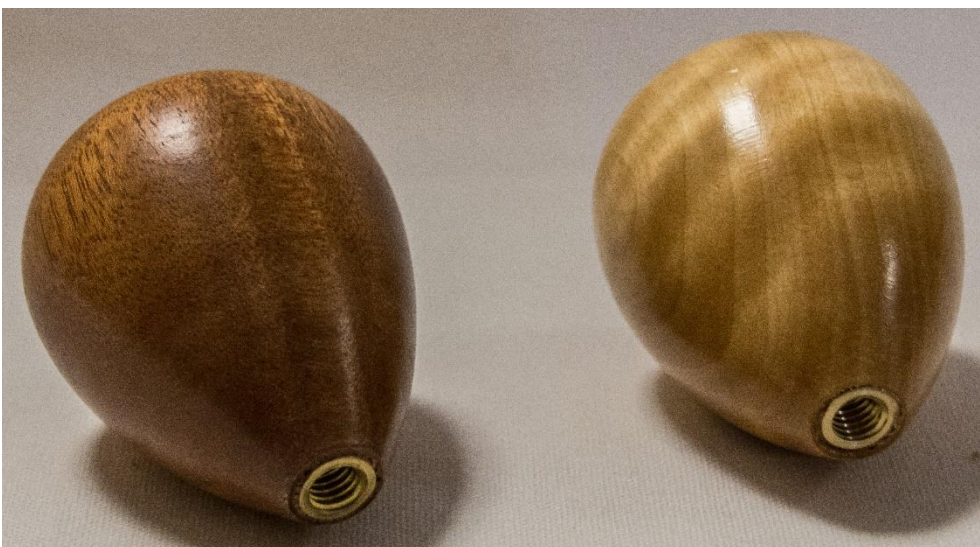
Beer Tap Handles and hand carved Birch Bowl presented by Kent Townsend