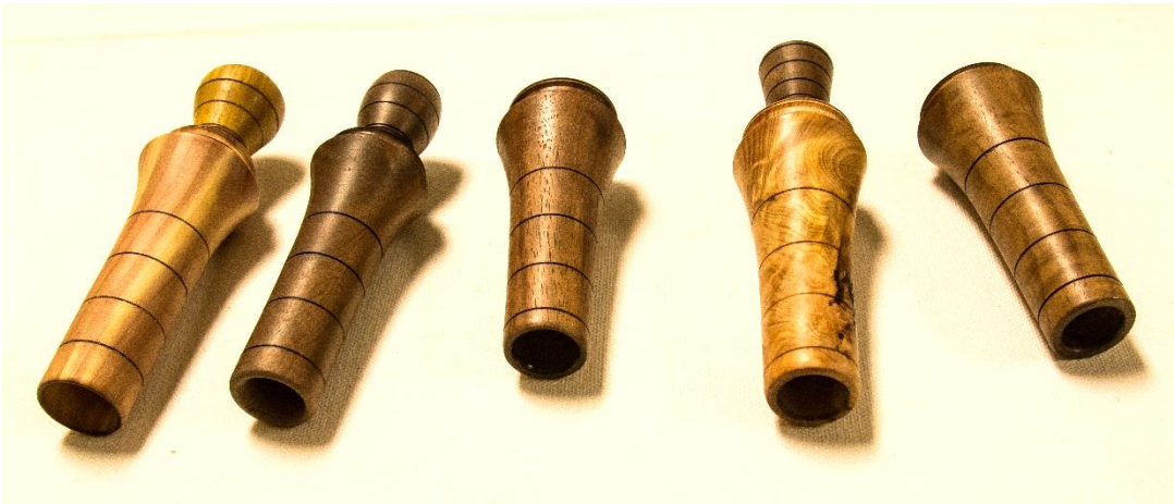
Duck Calls by Dwight Herrick