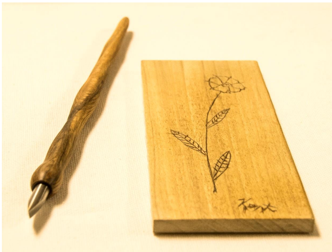
Kolrosing Pen and sample image by Kent Townsend