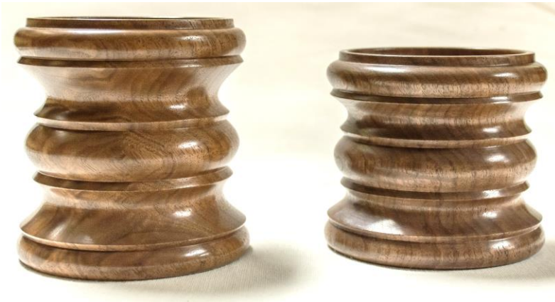
Walnut Vase and two Walnut Candleholders by Harlan Henke