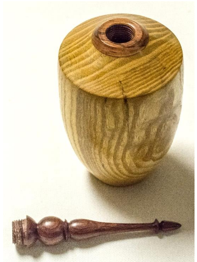
Walnut and Mulberry Hollow Form with Threaded Finial by Jim Tate