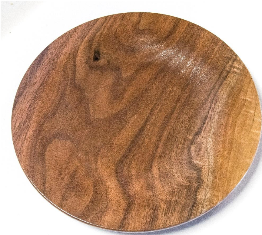
Walnut Platter turned by Mikeal Jones