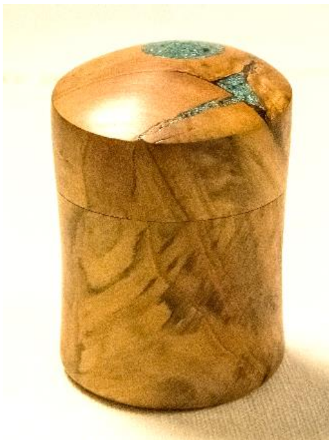
Applewood with Turquoise inlay box and off center turned lid by Jim Tate.