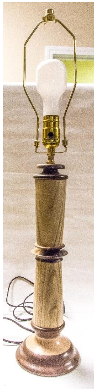
Walnut, Maple and Black Walnut lamp presented by Jack Murphy