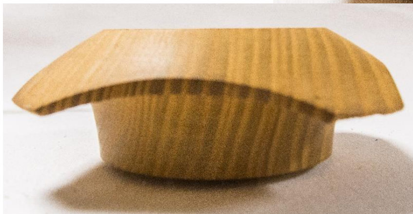
Black Walnut cake stand turned by Vince Robinette