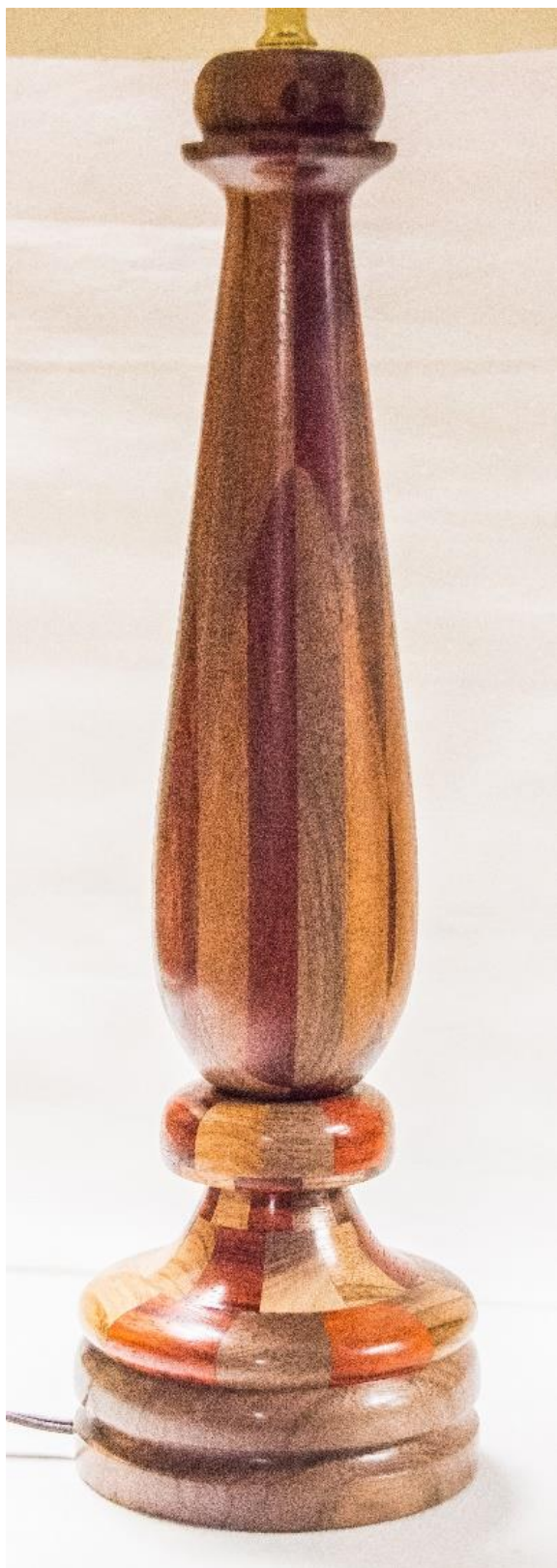
Bloodwood and Walnut Segmented Lamp turned by David Dinkel