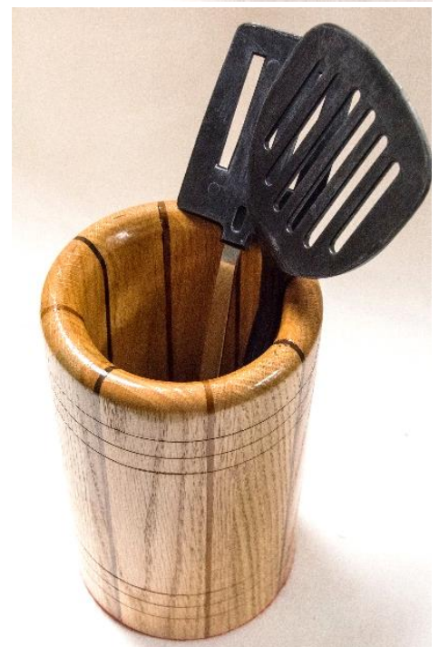
Segmented kitchen implement holder turned from Oak, Walnut, Cherry by Dale Pollard