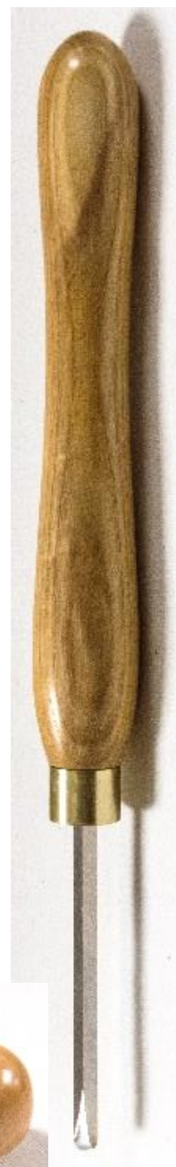
Nutcracker, Ash tool handle, and Box Elder box by Andy Brundage