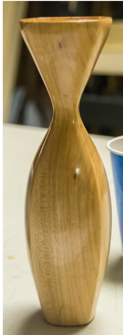
Square Vase turned by Dale Pollard