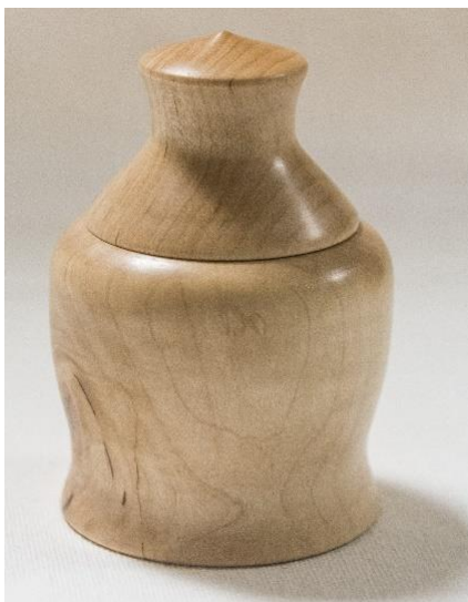
Threaded box and Finial box by Jim Tate.