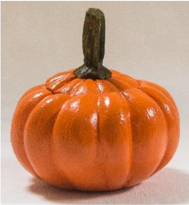
Pumpkin Box by Kent Townsend