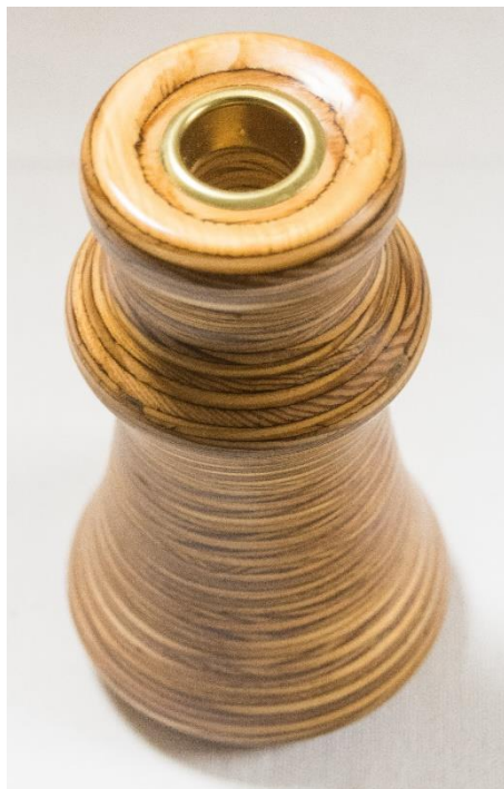
Plywood laminate Candle Holder by Dale Pollard.