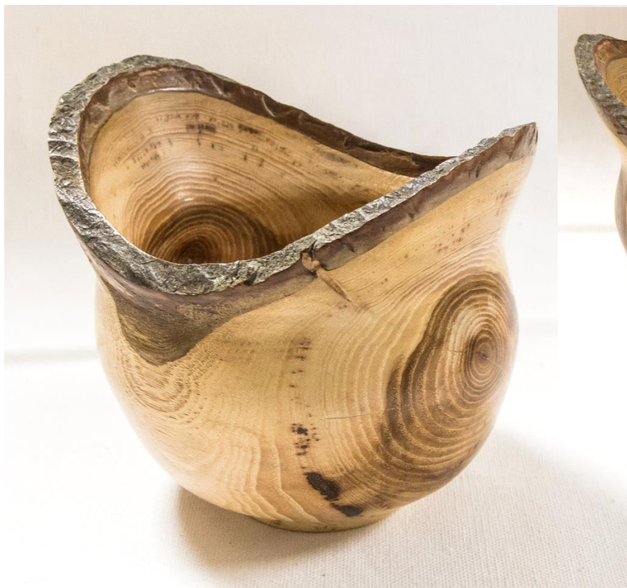
Pignut Hickory natural edged bowl turned by Phillip Irwin.