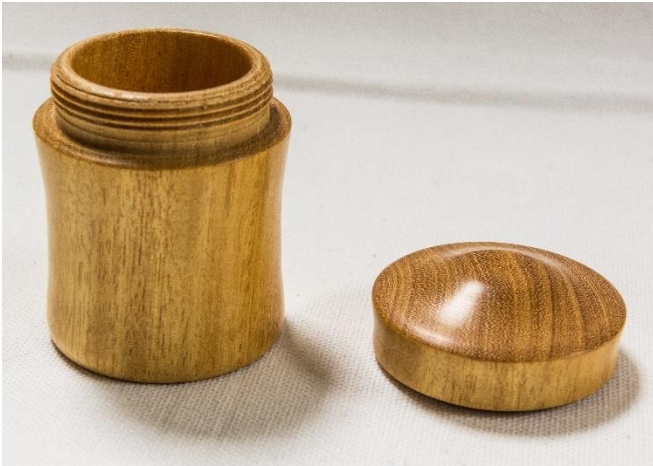
Threaded box turned from Australian Osage Orange by James Tate