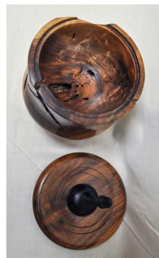
Walnut hollow-form with finial turned by Vaughn Bradley.