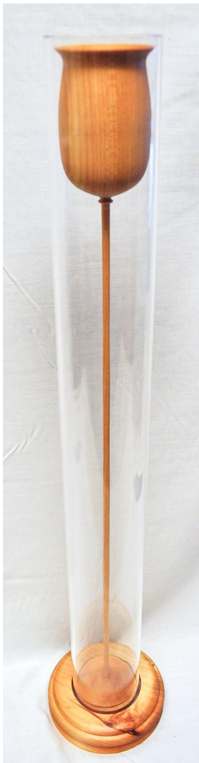
Long-stemmed Goblet presented in plastic tube by Kent Townsend.