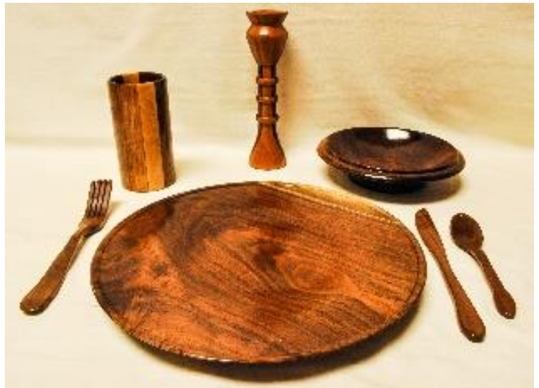
Walnut place setting complete with flatware, glass, and candleholder turned by Jack Murphy.