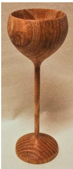
Oak thin stemmed goblet turned by Dale Pollard