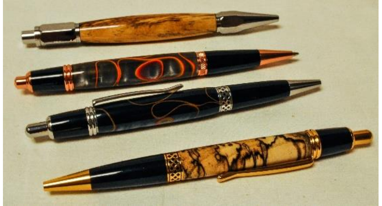
Larry Settle brought four "Click" pens made from various materials.