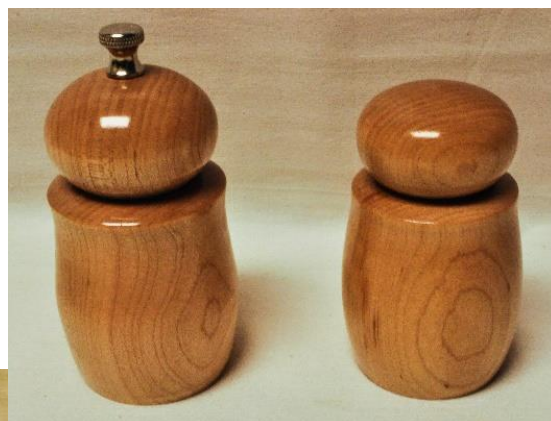
Chip Siskey brought a Persimmon bowl, willow bowl, an upside down salt shaker, peppermill, and a partially finished Purple Heart platter.