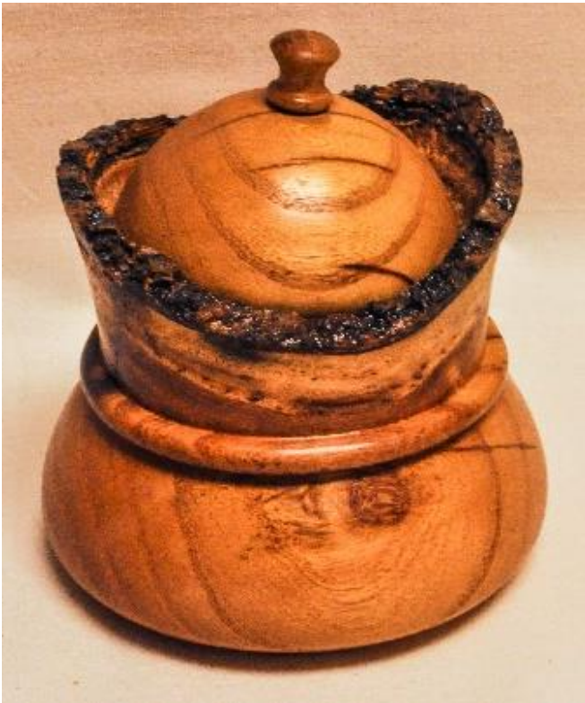
Randy Hawn presented a natural edge Mulberry Box.