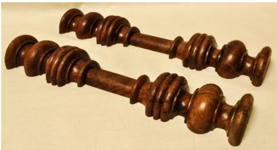
Walnut clock trim by Dwight Herrick