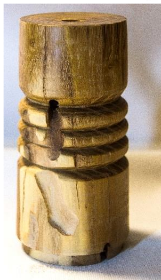
Peppermill lost to Carpenter Ant by Leland Finley