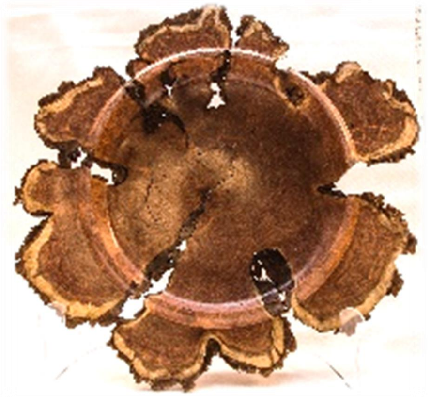
Mesquite Platter and "work in progress by Chip Siskey