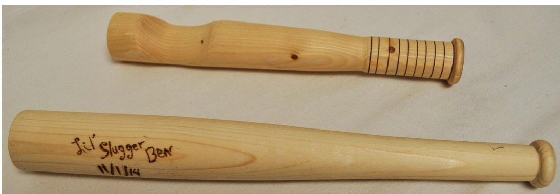
David Bartlett brought 2 baseball bats turned from yellow pine.