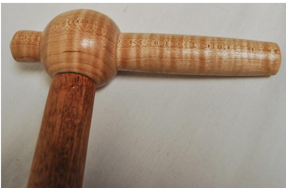
Kent Townsend presented a self-standing Cane turned from Mahogany and Tiger Maple.