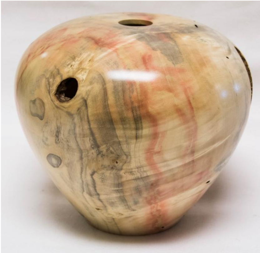
Chip Siskey brought a Box Elder Vase