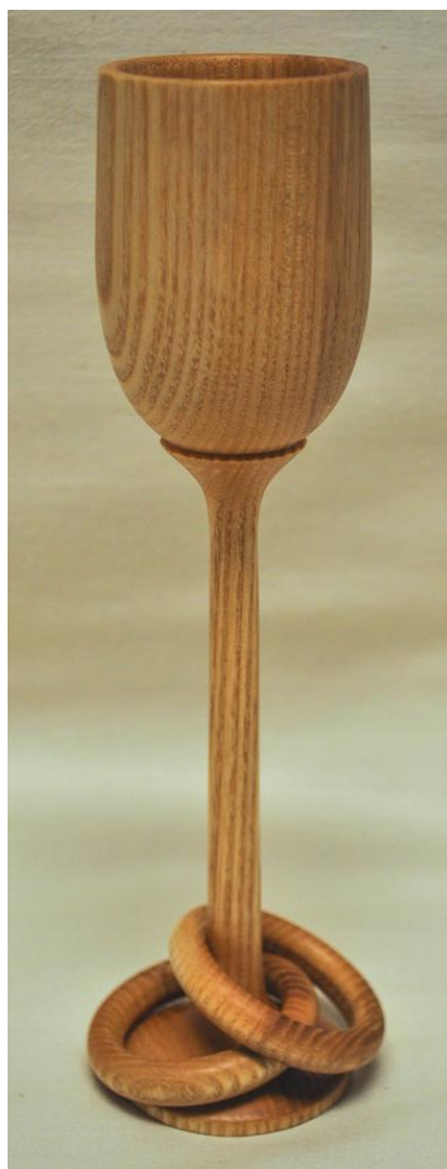
Goblet with captive rings presented by Jim Tate