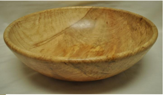
Kent Townsend brought in a Sycamore Bowl and a Natural Edge Vessel turned from an Oak Burl