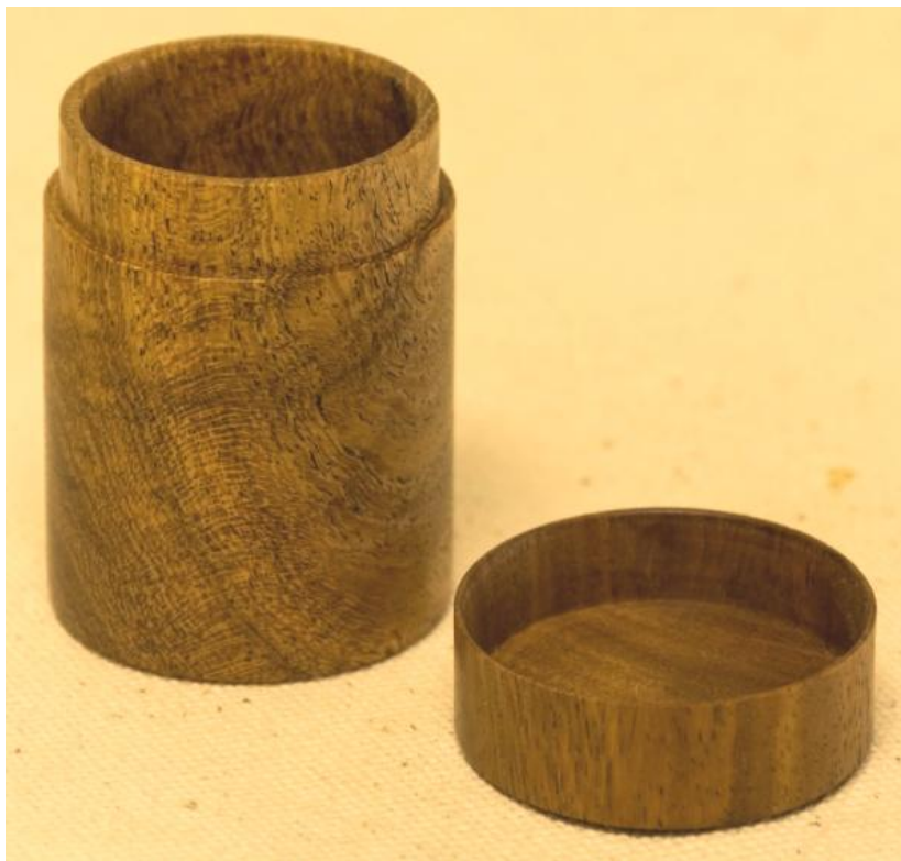
Mesquite Box presented by Kent Townsend.