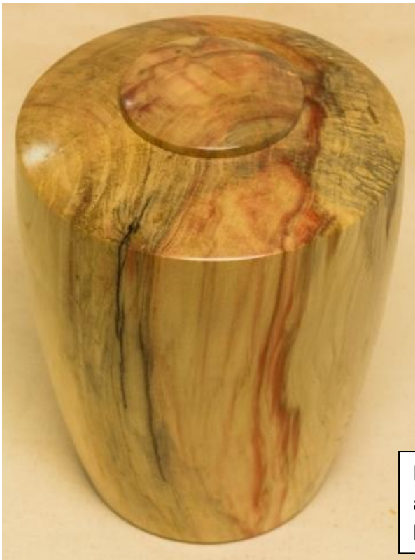
Finished Urn and Micro Skew by Chip Siskey