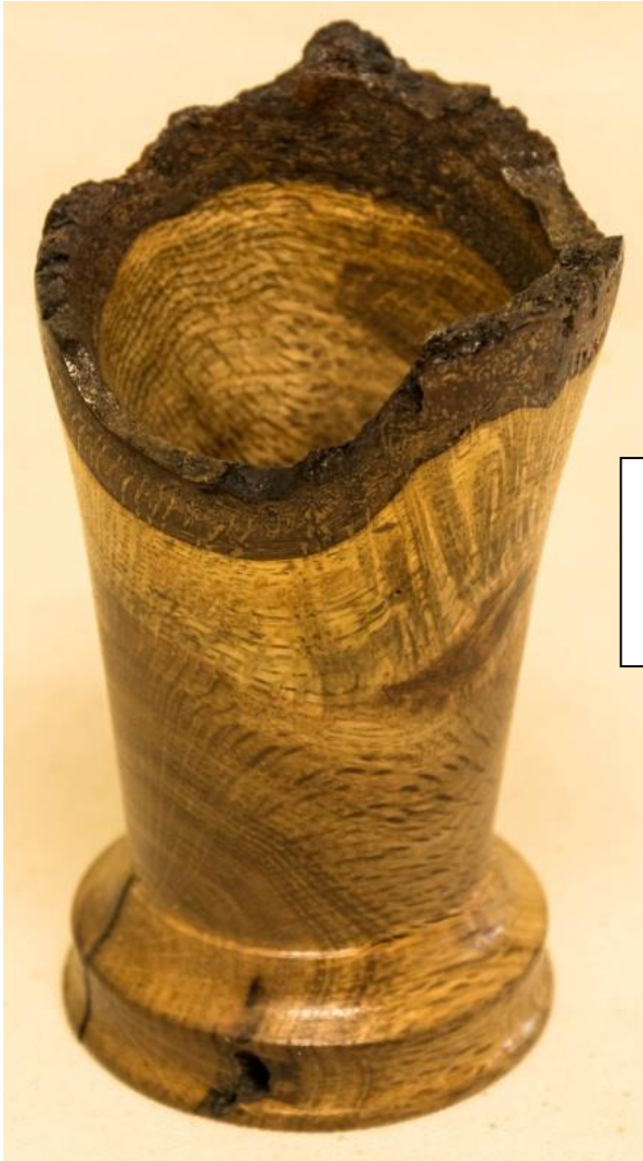
Randy Hawn brought an Oak Natural Edge form.