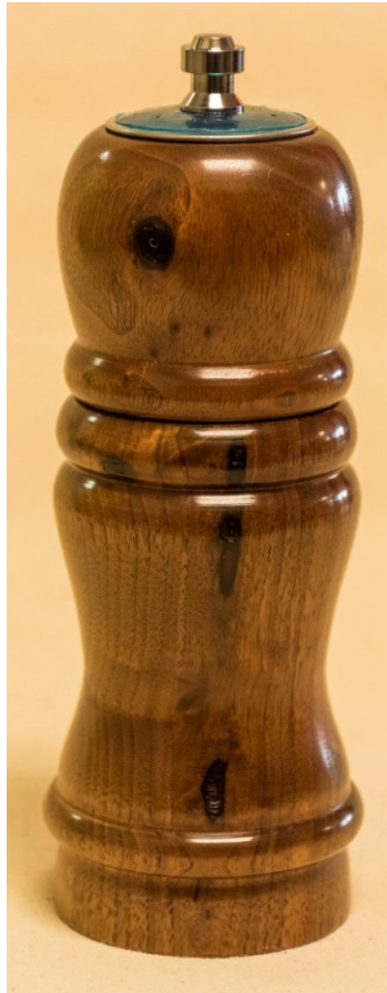
Walnut Pepper mill and salt shaker turned by Stephen Campbell