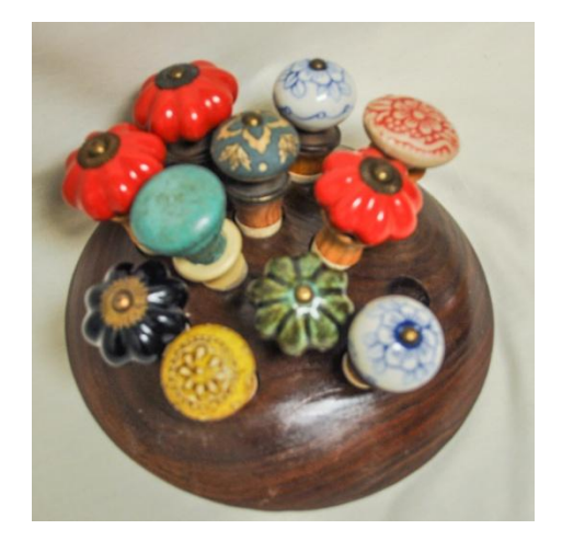
Kent Townsend brought in several bottle stoppers made from drawer pulls in a walnut stand.

Light Pen and Purse Holder both turned by Larry Settle.