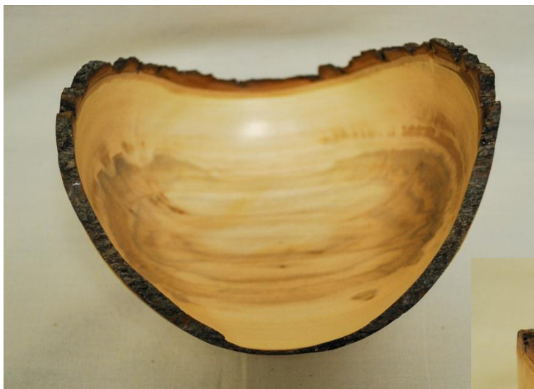
Chip Siskey turned a Natural Edged Bowl