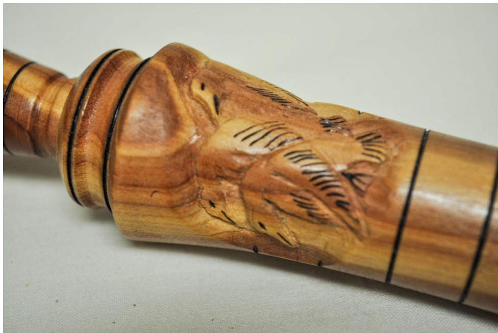
Carved Duck Calls by Dwight Herrick