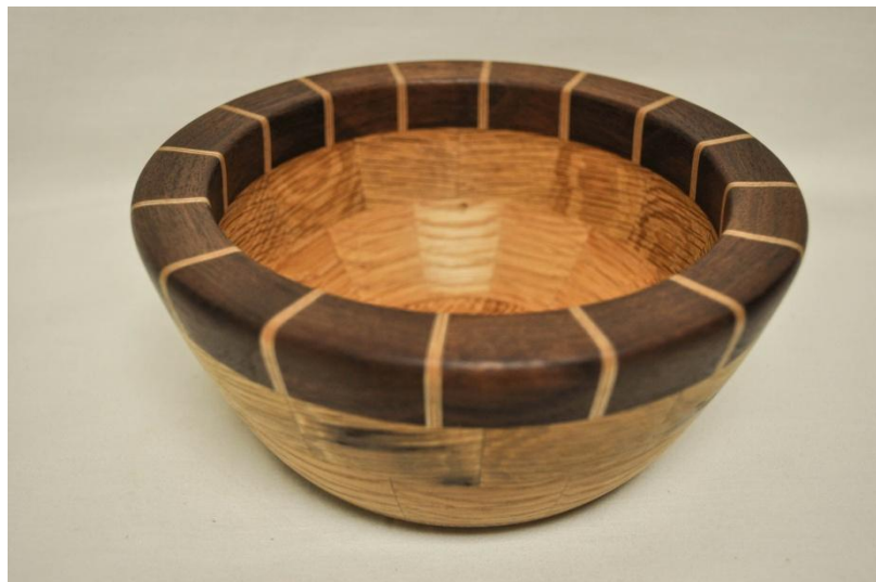
Walnut and Oak Segmented Bowl – Dale Pollard