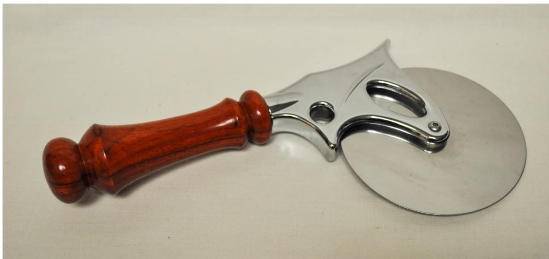
Pizza Cutter with Padauk handle by Harlan Henke