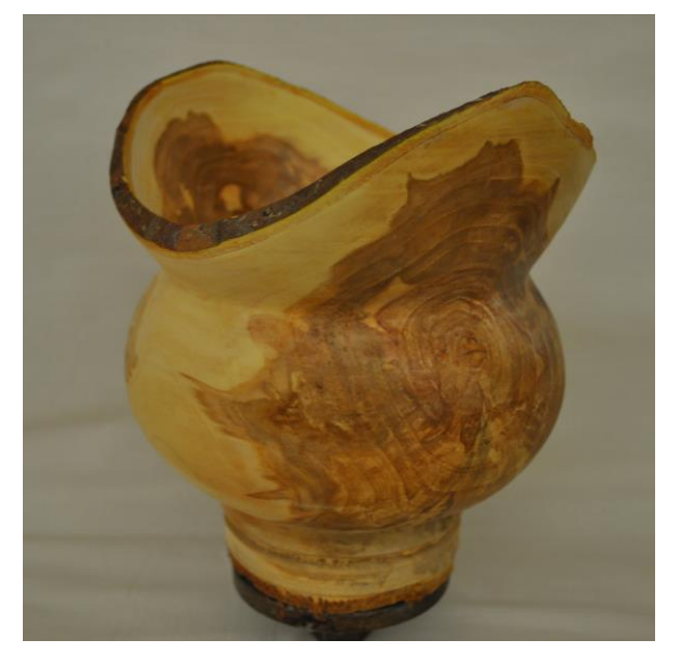
First time guest Bob Irwin brought these two Apple vases that are works in process.