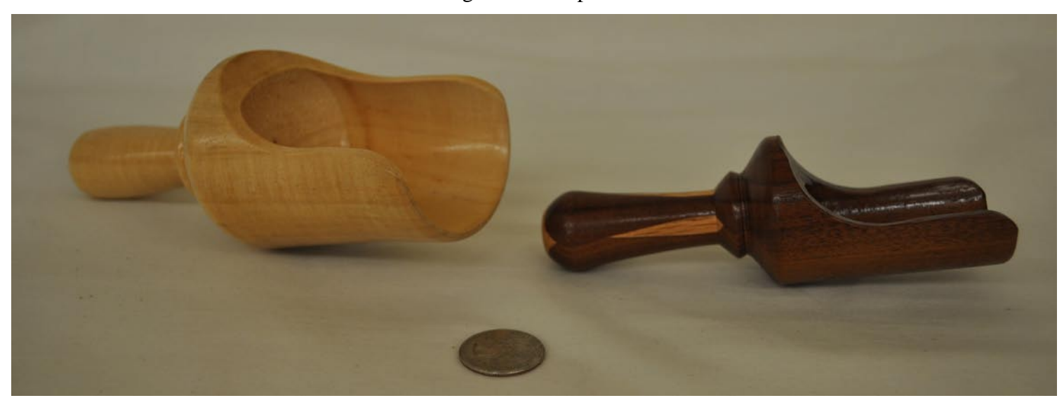
Dale Pollard brought two scoops.