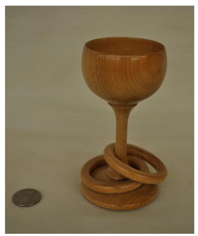
Chip Siskey brought a Banksia pod vessel (upper left), a captive ring goblet (above) and a maple salad bowl (left).