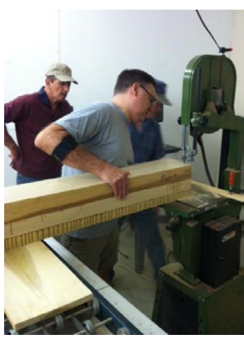
Chapter Sponsors and Supporters