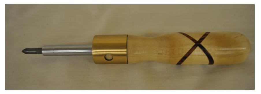
Screwdriver by Chip Siskey