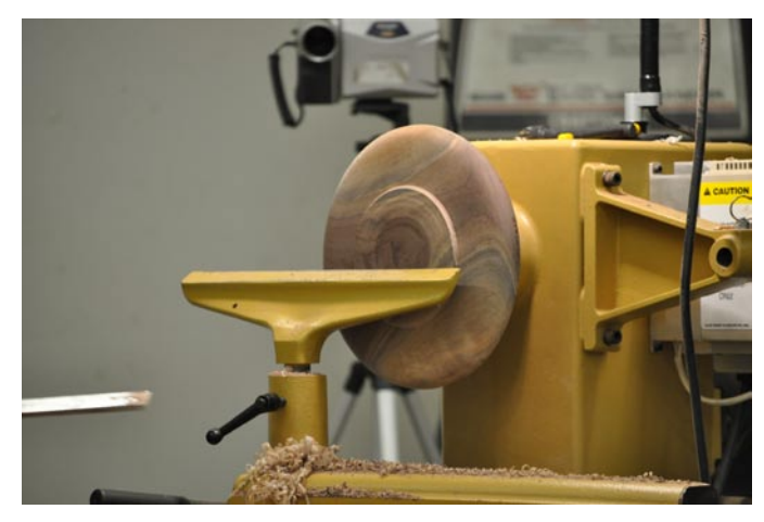
Some examples of presenter Vince Robinette's handiwork