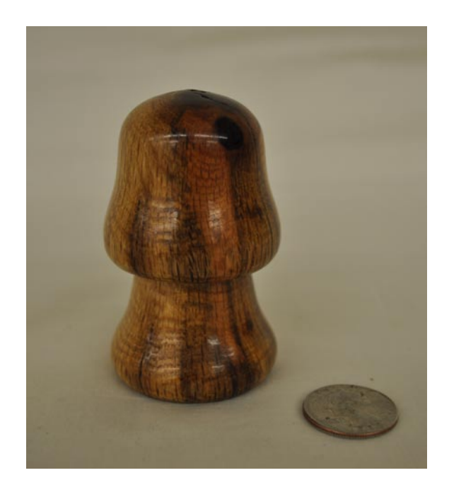
Blackjack Oak mushroom by Dale Pollard