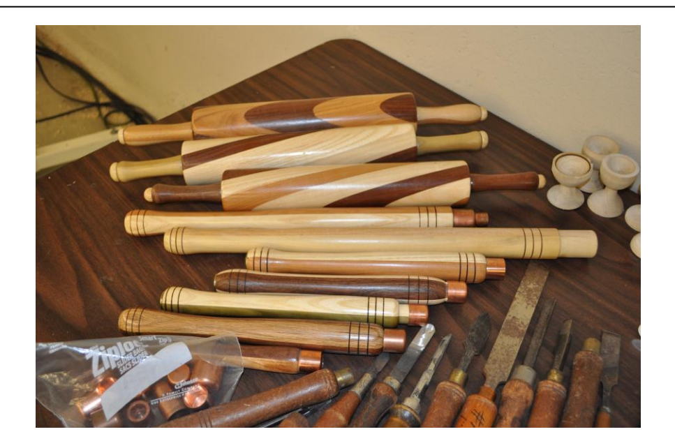
Don Heese brought these rolling pins and tool handles.