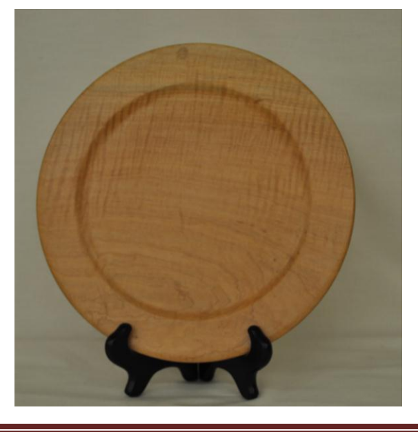
Kent Townsend's curly maple platter.