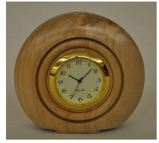
Chip Siskey brought this Mulberry natural edge bowl and this desk clock