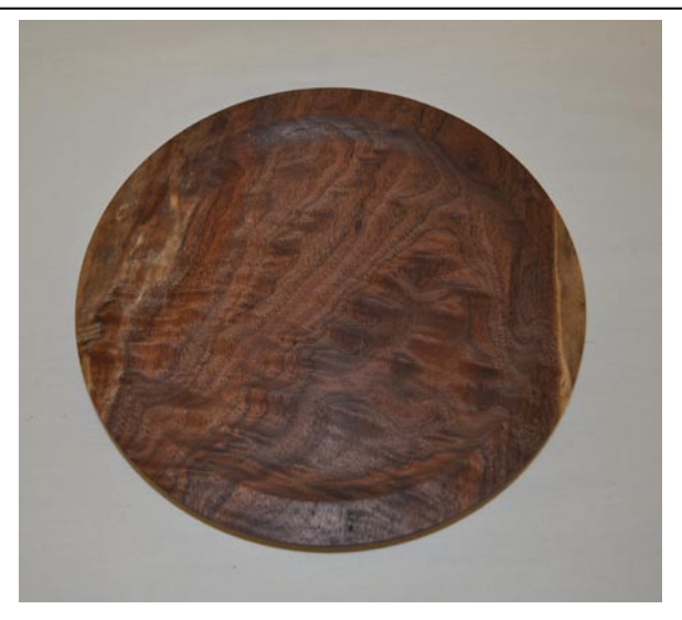
Curly Walnut platter by Vince Robinette