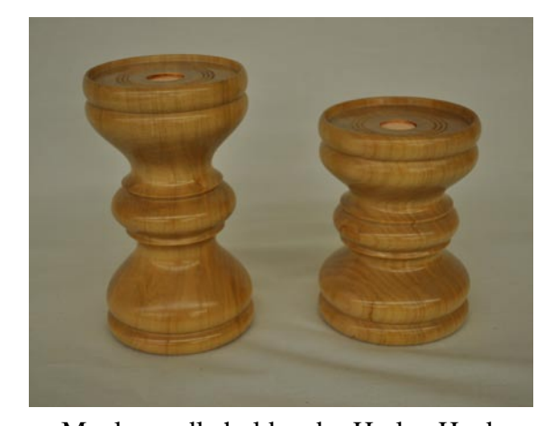
Maple candle holders by Harlan Henke