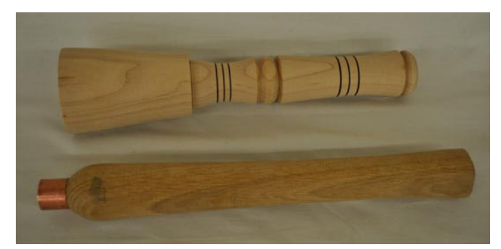
Thanks, Kent for an excellent program!