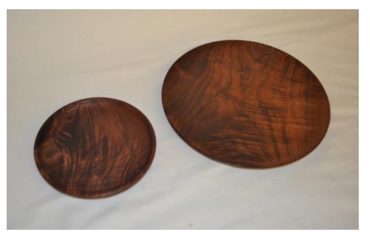
Black Walnut platters by Vince Robinette