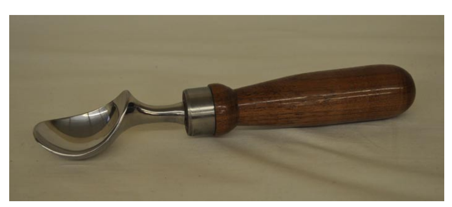
Walnut ice cream scoop by Don Mahaffy