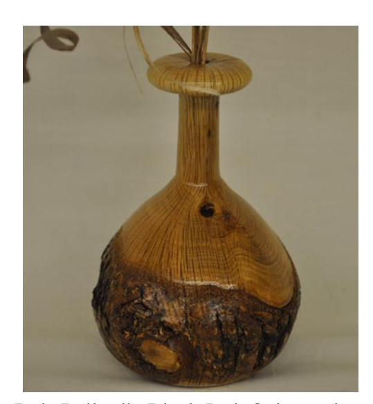
Dale Pollard's Black Jack Oak weed pot