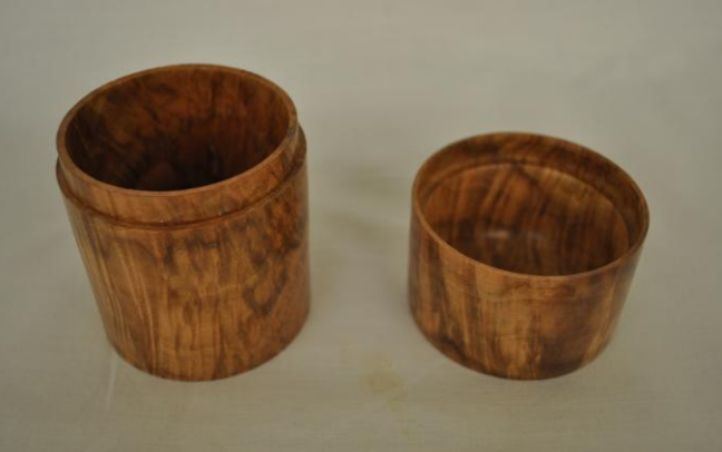
Kent Townsend's Camphor box