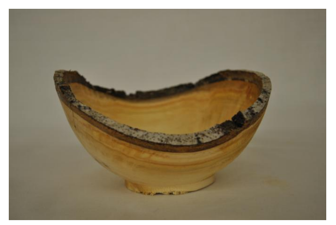
Chip Siskey's natural edge Birch bowl