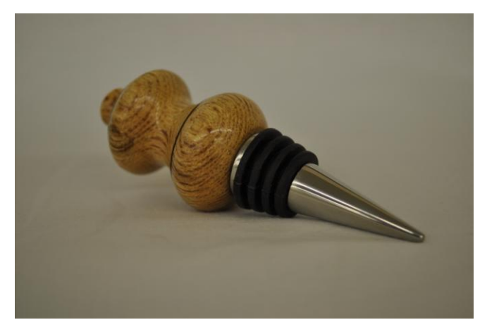
Black Jack Oak bottle stopper with black embossing powder by Dale Pollard