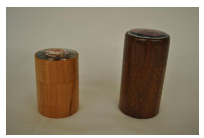
Cherry box and Walnut box by Andy Brundage