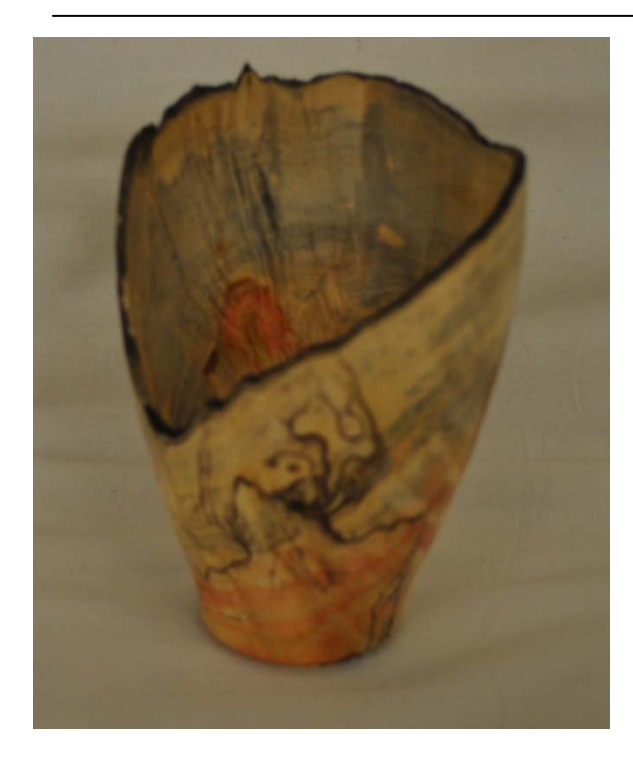
Box Elder Vase by Chip Siskey