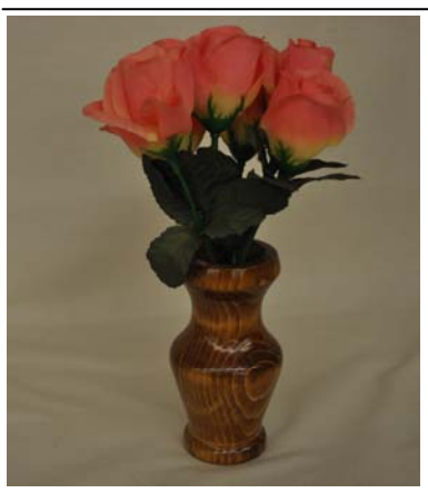
Dale Pollard's Pine 2x4 Vase