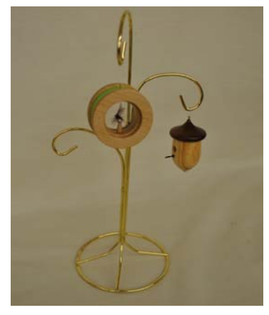
4 Pieces by Chip Siskey: