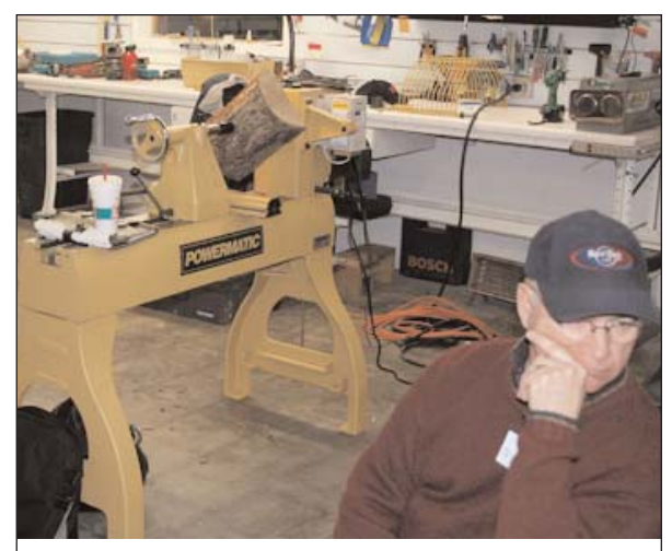
The wood just atalkin', the new NWT lathe just asittin', next month's demonstrator just alist'nin'

We're looking to add more and more pictures to our Gallery pages. Turn 'em and bring'em! Everyone enjoys seeing others' work. That's part of why we're here, to observe, to learn, to share.